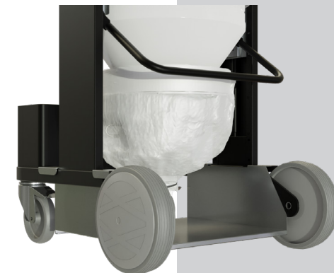
▶ Longopac® continuous bag collection system