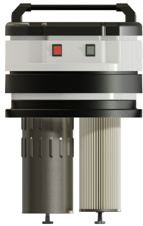
◀ Motorhead with automatic cleaning system ICLEAN