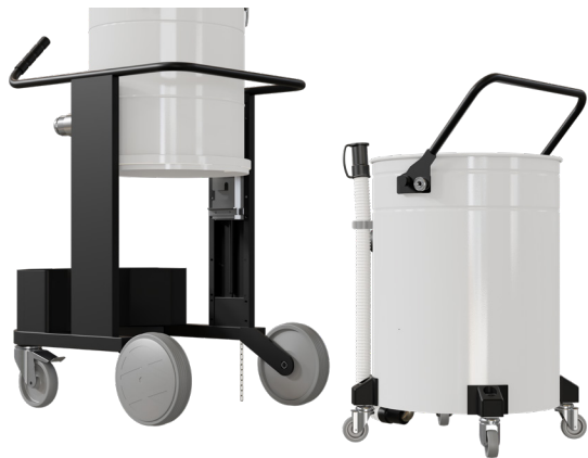
◀ Easy barrel release system